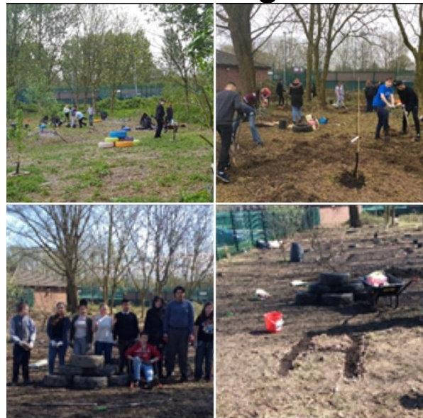
The site during the Challenge