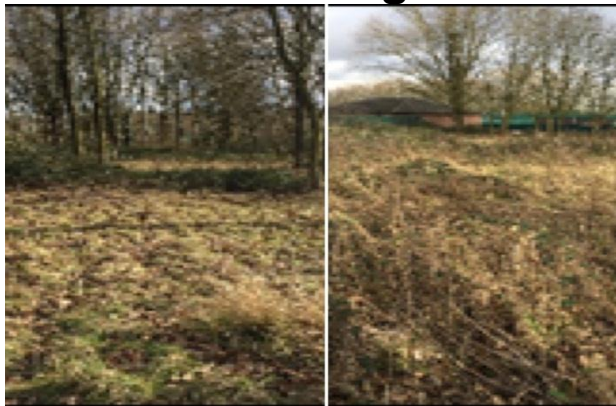
The site before the Challenge