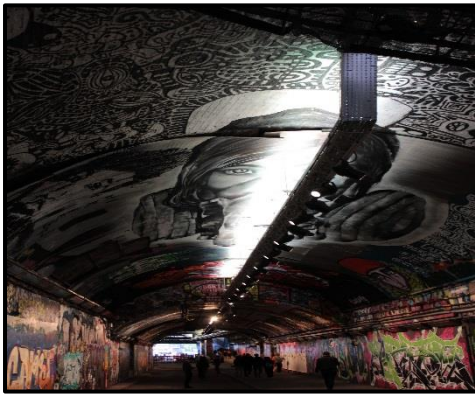
Leake Street - A graffiti art underpass.