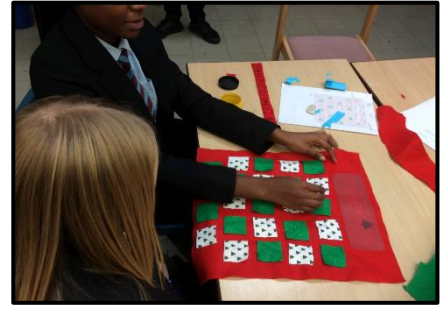
11 GMK Creating Advent Calendars

All learners who took part in the day have shown determination and resilience, they have developed not only their knowledge of industry but have developed their communication and team working skills.