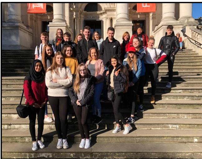
Photography students stood outside the Tate Britain.

On Friday 27th October the Art team took 20 Year 12 and 13 pupils to London to experience a variety of galleries and the city itself. It was a wonderful experience that helped broaden the minds of our learners. Here is one student's account of the day.