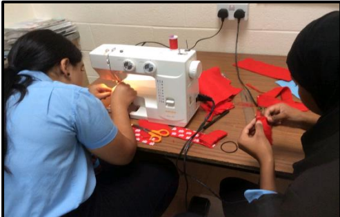
11 RHM Using sewing machines to Create Advent Calendars

On Thursday November 16 th three form groups in year 11 took part in their WBQ Enterprise and Employability Challenge day. They were required to work as a team to create a product for their own company. Learners worked as a team to design and create a product that showcased their abilities to plan, develop and communicate.