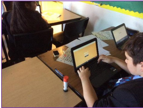
Year 7 learner using Kahoot to reflect back on the learning from the lesson they were taught by year 11 learners

On the week of November 18 th until November 22 nd all learners in year 11 took part in their WBQ Community Challenge Day. Each class had to form a group to create a presentation to year 7s about a topic that they decided to do such as police force, fires, anti-social behaviour, drugs misuse and train safety. Each group had to prepare a lesson involving different activities and resources to communicate with the year 7s about the topic.