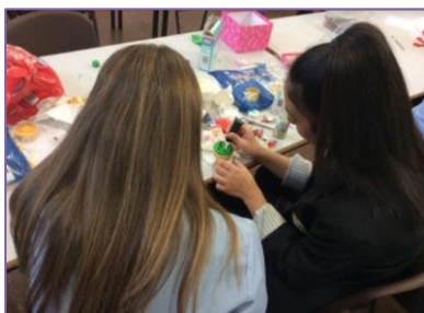
Learners working together to construct their Enterprise product.

All learners who took part in the day have shown determination and resilience, they have developed not only their knowledge of industry but have developed their communication and team working skills.